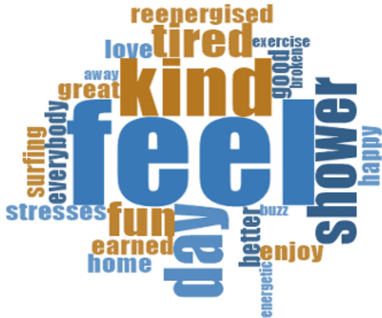
Figure 3: Word cloud representing the frequency of words related to Surfwell experience in the interviews. The size of each word indicates its frequency across the interviews.

The words most frequently associated with Surfwell during this phase of the research were “feel” and “kind”. Other frequently used words included “reenergised”, “fun”, “enjoy”, “better”, “love”, “happy” and “good”. The most commonly occurring words are shown in the word-cloud below (Figure 3).